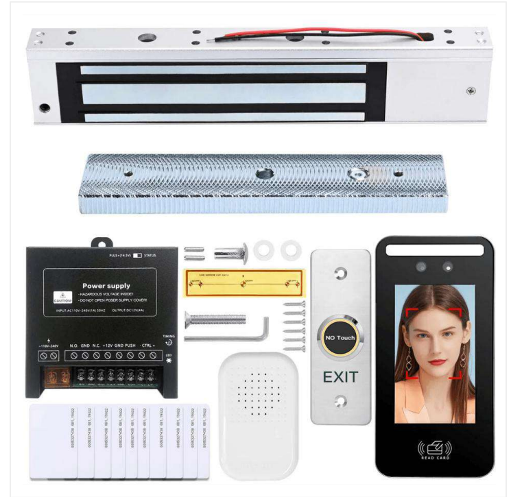
INTEGRATED SECURITY INFRASTRUCTURE

The modular AI framework can easily expand as ISATL's facilities and logistics operations grow.